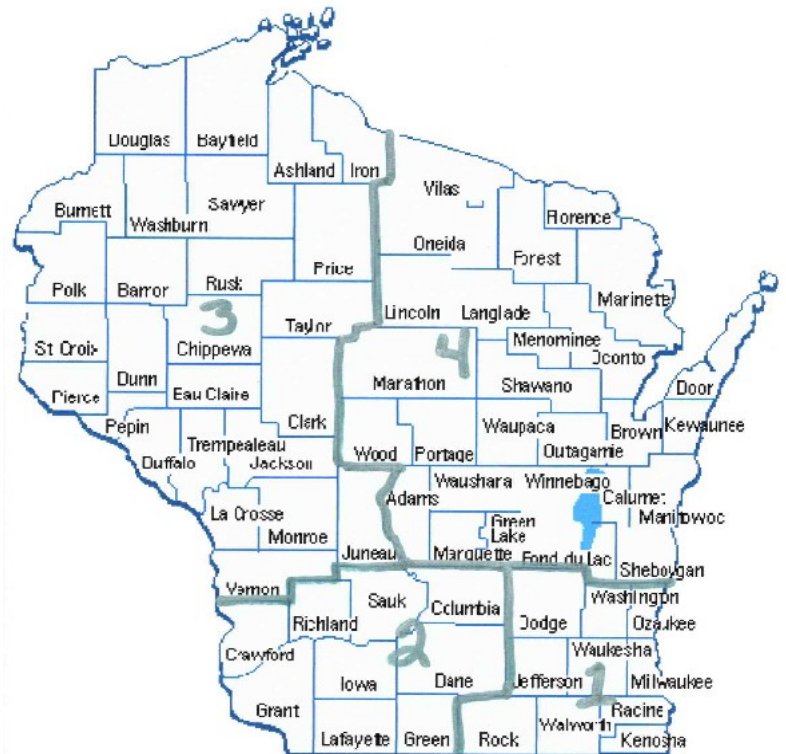
New Canton Map Approved at March 7, 2020